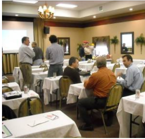
Social Hour at the 2009 OPCA Conference